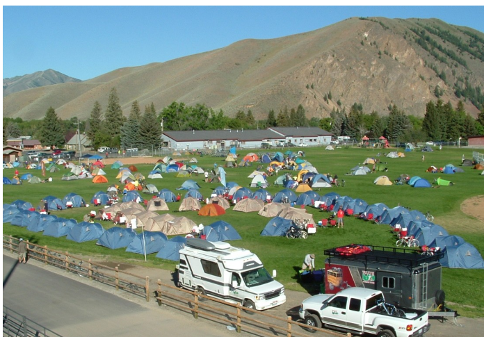
Ride Idaho campers at Nelson Field.

The bikers camped out at Nelson Field and used the new Rodeo Park facilities for their shower trailer and support vehicles.