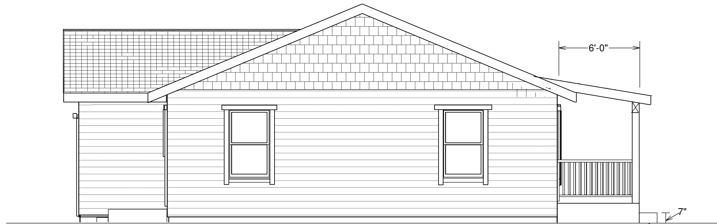
SOUTH ELEVATION 1/4" = 1'-0"