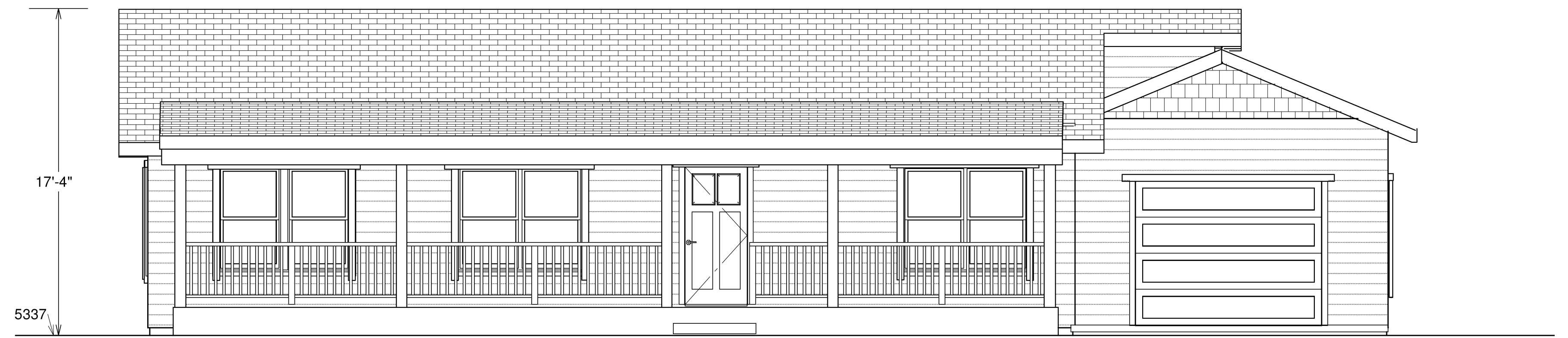
EAST ELEVATION SCALE: 1/4" = 1'-0"