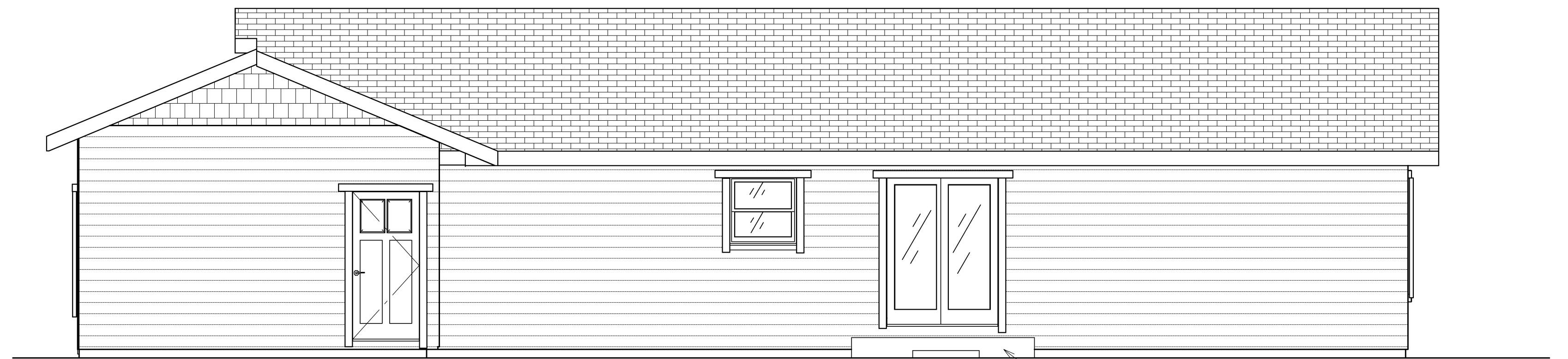
WEST ELEVATION SCALE: 1/4" = 1'-0"