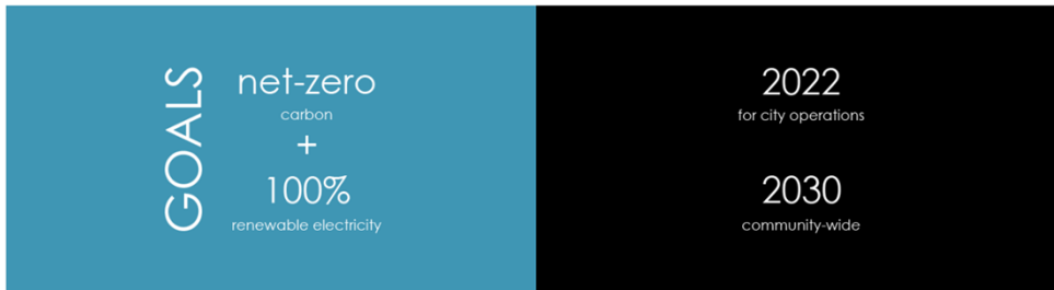
Park City: a Municipality Leading Sustainability