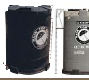
4.900 & 6.900-Gallon