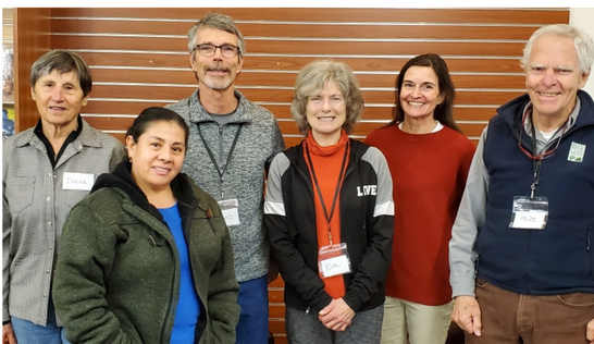
Volunteers take time out to pose between Conversacion & Tutoria de Ingles classes, held weekly in Town Center West.

in 1968, serving as Hailey's post office until the mid-nineties. Looking ahead, the City saw this land & building acquisition adjacent to the city hall and library as an investment in our growing city's future. The city offices and the library had been contending with a limited space issue for several years, and Town Center West (TCW) proved a convenient solution. The building was christened Town Center West by popular vote, and last year, 7059 people attended 373 events at TCW.