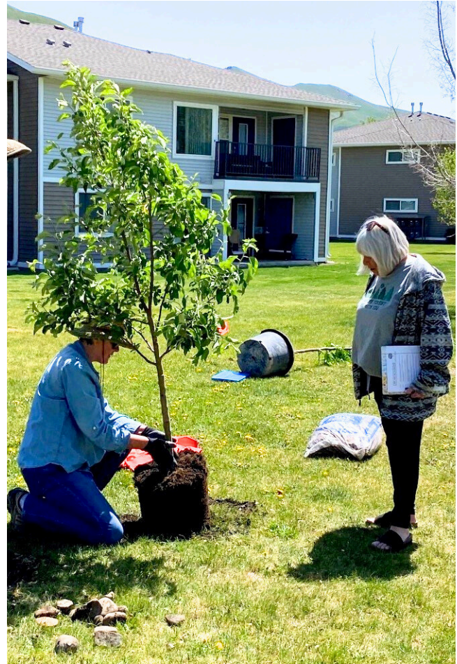
ARBOR DAY TREE PLANTING AT KIWANIS PARK

Hailey is the greatest place I know to live and work, and for one primary reason: the community. We value getting to know each other as neighbors and we operate with a small-town, friendly approach. I place great importance on this sense of community, shared neighborly attitude and cooperation.