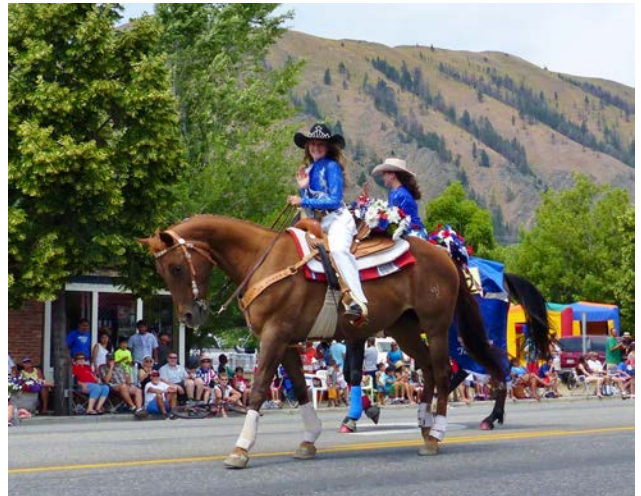
FOURTH OF JULY PARADE