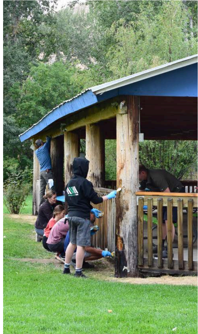
JUST SERVE VOLUNTEERS AT HOP PORTER PARK