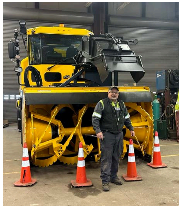
NEW STATE OF THE ART SNOWBLOWER