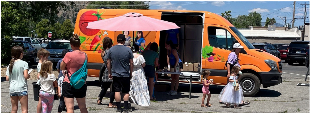
BLOOM TRUCK AT THE HAILEY PUBLIC LIBRARY