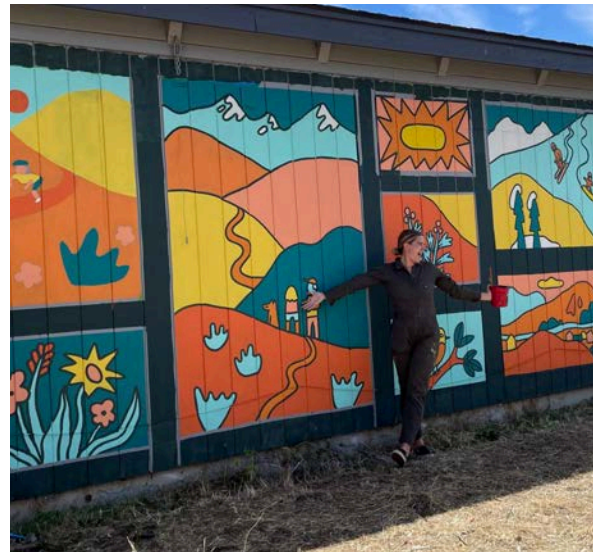
NATURE WINDOWS MURAL