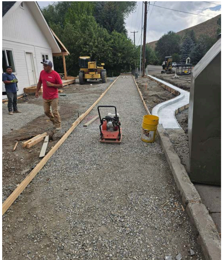
NEW SIDEWALK, CURB, AND GUTTER ON WEST BULLION