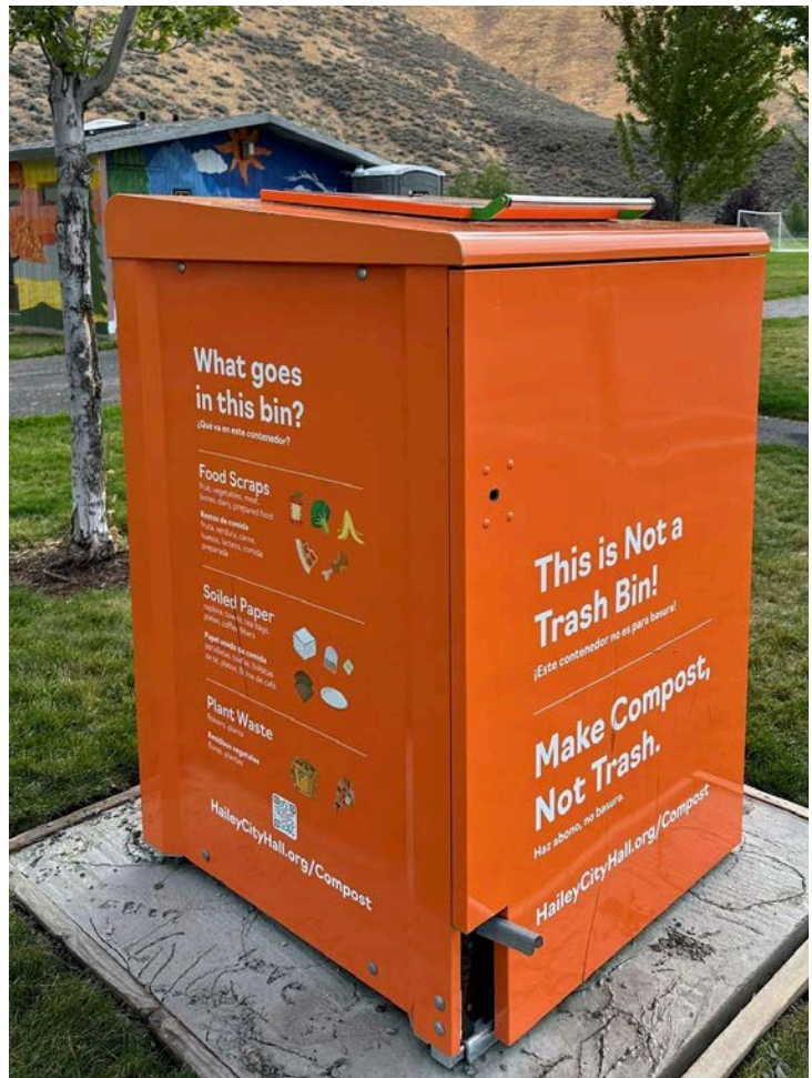
FOOD WASTE COLLECTION BIN