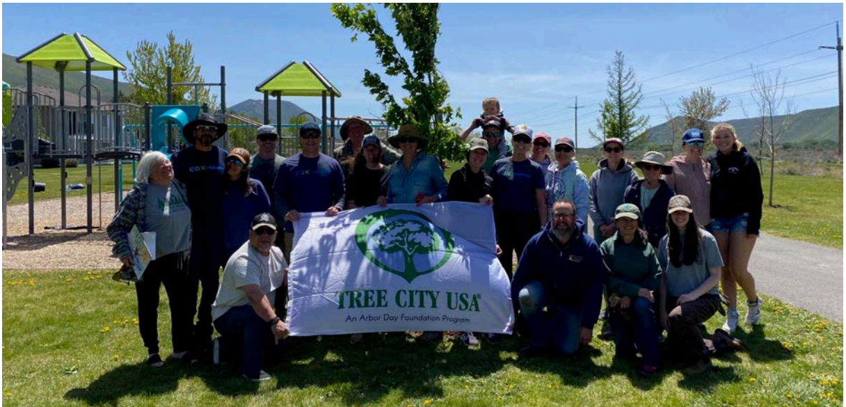
ARBOR DAY TREE PLANTING AT KIWANIS PARK