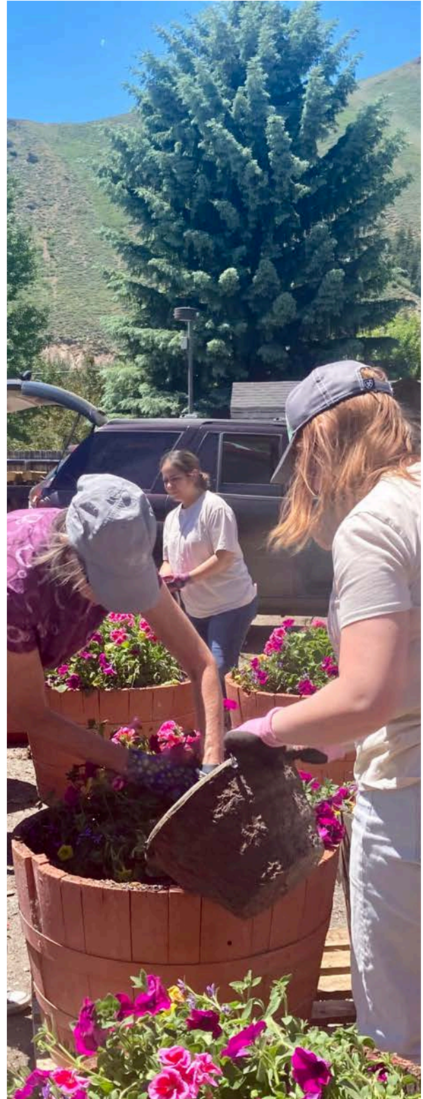
CITY EMPLOYEES: HAILEY FLOWER PROJECT

As we grow our town, our maintenance demands increase. We have installed a laudable number of pathway, landscape and tree projects over the last year. We have also grown our summer Main Street flower project each year, with high community support. I staunchly believe that each new project deserves regular top-notch maintenance. I will be actively recommending ongoing maintenance budgets to ensure that we can proudly take care of our assets.