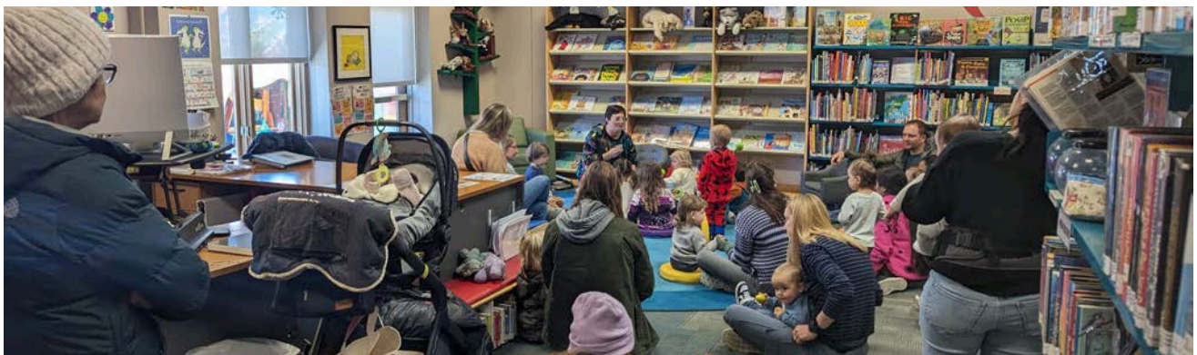
STORY TIME AT THE LIBRARY