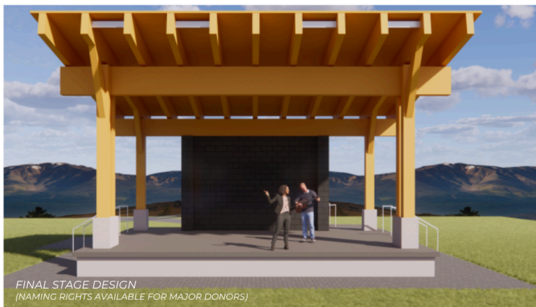
FINAL STAGE DESIGN (NAMING RIGHTS AVAILABLE FOR MAJOR DONORS)

Help us raise the roof by donating or becoming a sponsor. All funds go directly toward raising the roof!