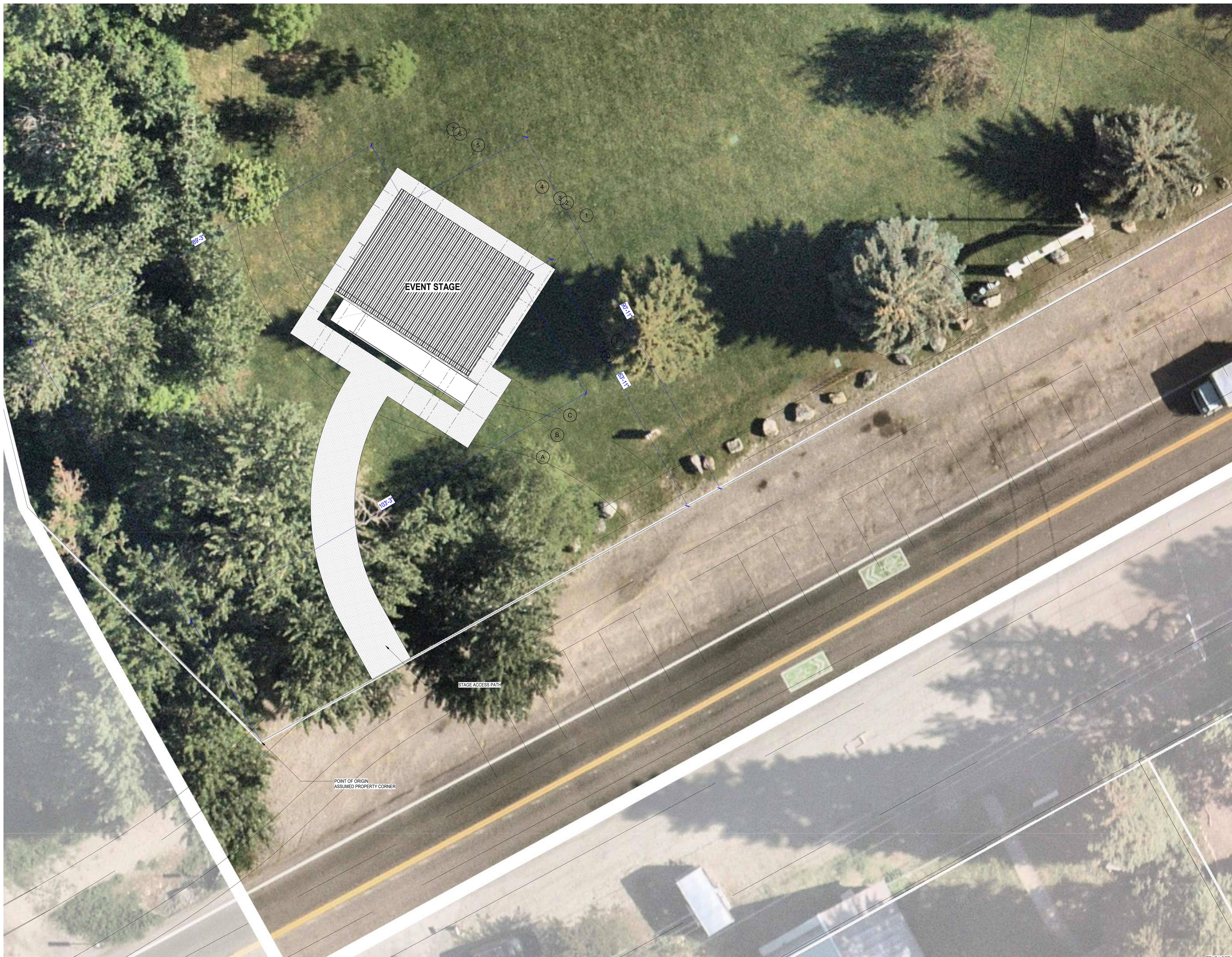
A1 SITE PLAN 1/8" = 1'-0"

NOTES: 1. DIMENSIONS ARE APPROXIMATE. 2. FINAL STAGE LOCATION TO BE VERIFIED IN THE FIELD. 3. ADJUST LOCATION AS NECESSARY TO AVOID EXISTING UTILITIES, TREE CRITICAL ROOT ZONES, AND OTHER EXISTING FEATURES INTENDED TO REMAIN.