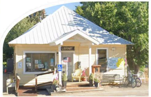
GOOD LIBRARIES MAKE A GREAT COMMUNITY