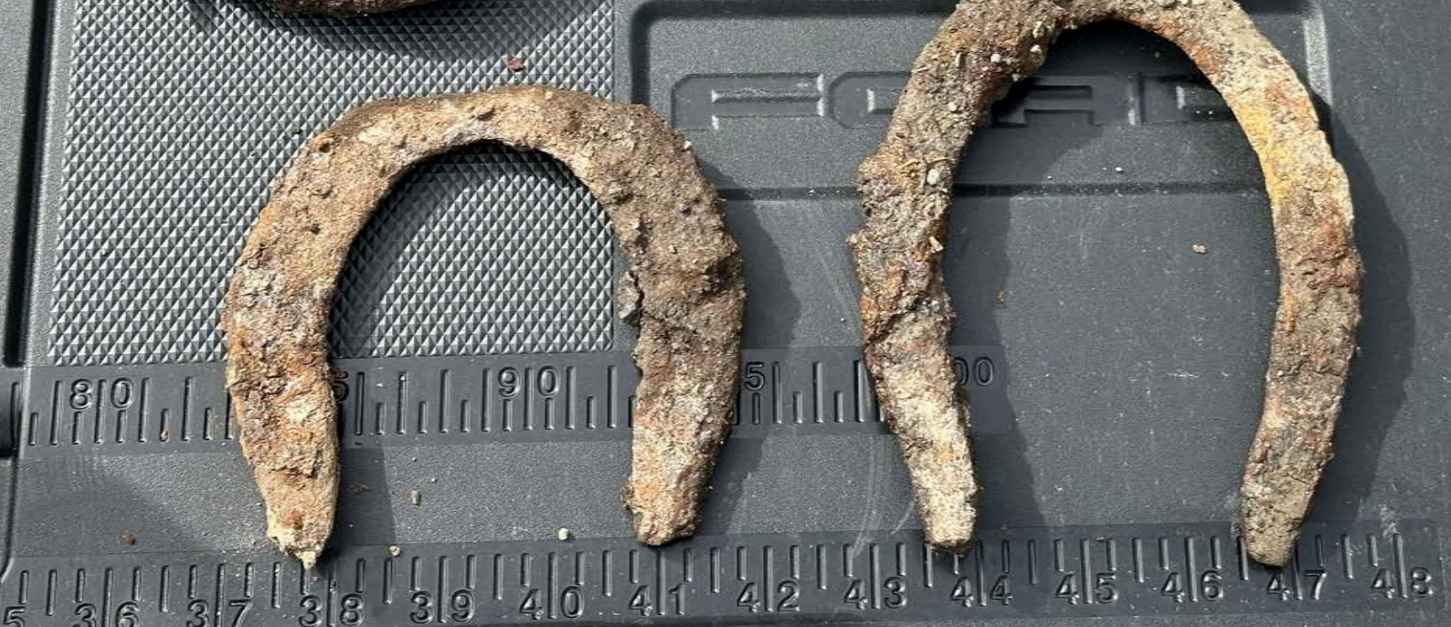
HORSESHOES FOUND DURING EXCAVATION FOR THE BULLION PATHWAY