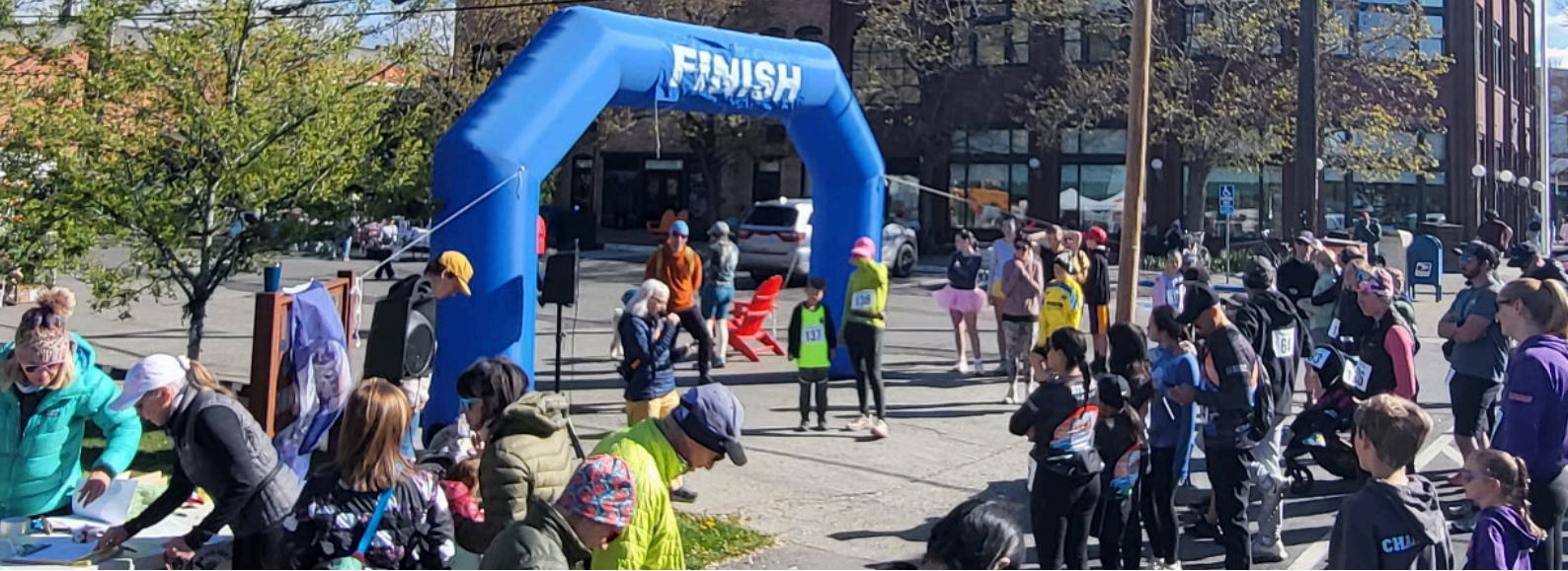
EARTH FEST CELEBRATION 2026